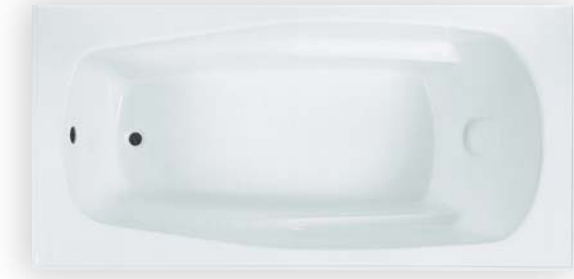
BUCHANAN Acrylic MODEL# AD7236 72"L x 36"W x 21 1/2"H