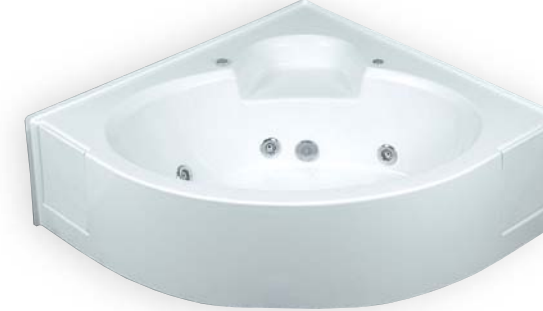
CORNER HALF MOON WITH FRONT APRON AND DUAL ACCESS PANELS Fiberglass MODEL# RE4330A CENTER DRAIN (FRONT) 60"L x 60"W x 21 1/2"H