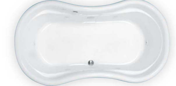
COLORADO Fiberglass MODEL# RE4272 72"L x 39"W x 22 1/4"H Center Drain