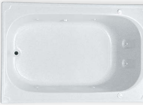
TAFT Acrylic MODEL# AD7248 72"L x 48"W x 21 1/2"H