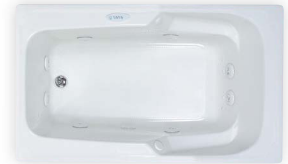
WASHINGTON I Acrylic MODEL# AD6036 60"L x 36"W x 21 1/2"H