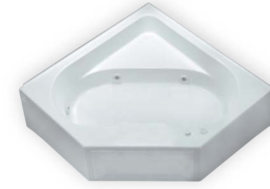
CORNER TUB AVAILABLE WITHOUT ACCESS PANEL Fiberglass MODEL# RE4060A CENTER DRAIN (FRONT) 60 1/2"L x 60 1/2"W x 34 1/2 x 34 1/2 x 45 1/2" x 19 1/4"H