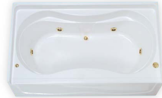
VICTORIA Fiberglass MODEL# RE3150 72"L x 42"W x 26"H CENTER DRAIN