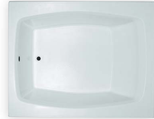
KENNEDY Acrylic MODEL# AD6048 60"L x 48"W x 21 1/2"H