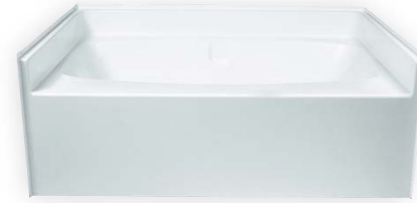
GARDEN TUB Fiberglass MODEL# RE3100 Center Drain 59 3/4"L x 42 1/4"W x 23 1/2"H