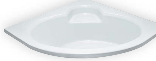
CORNER HALF MOON Fiberglass MODEL# RE4300 CENTER DRAIN (FRONT) 59 1/2"L x 59 1/2"W x 19 1/2"H

Note: Overflows are not pre-drilled, please specify if needed.