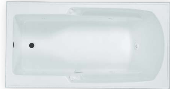
WASHINGTON II Acrylic MODEL# AD6032 60"L x 32"W x 21 1/2"H

Clarion's whirlpool and soaker tub collection offers both acrylic and fiberglass models. Clarion's acrylic models are vacuum formed from a one-piece solid sheet of cast acrylic to provide years of care free use. Each whirlpool is engineered and manufactured to meet the most demanding specifications. Clarion's acrylic is the tub of choice for many families. Clarion's gel-coated fiberglass whirlpools and soaker tubs are manufactured with the same exacting standards as our acrylic products.