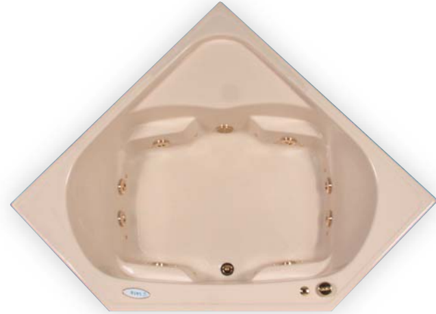
NIAGARA Acrylic MODEL# AD6060DS 60"L x 60"L x 29 3/4" W x 29 3/4" W x 21"H