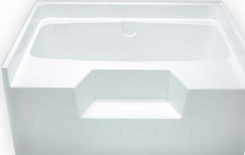
GARDEN TUB Fiberglass MODEL# RE2000 54"L x 42"W x 24 1/4"H CENTER DRAIN MODEL# RE3000 59 3/4"L x 48 1/4"W x 23 3/4"H CENTER DRAIN