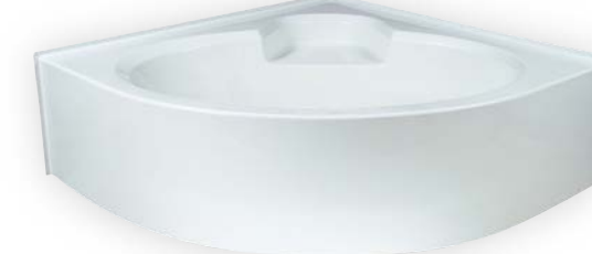
CORNER HALF MOON WITH FRONT APRON Fiberglass MODEL# RE4330 CENTER DRAIN (FRONT) 60"L x 60"W x 20 1/2"H