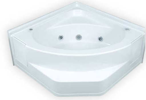
CORNER GARDEN TUB WITH ACCESS PANELS Fiberglass MODEL# RE4500A CENTER DRAIN (BACK) When Jetted LH Motor Placement Only 55 1/4" x 55 1/2" x 38" x 38" x 21" x 24 1/4"H