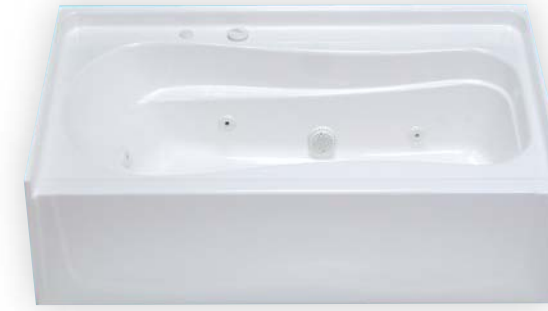
ANGEL Fiberglass MODEL# RE3660 60"L x 37"W x 20 1/2"H Left or Right Drain