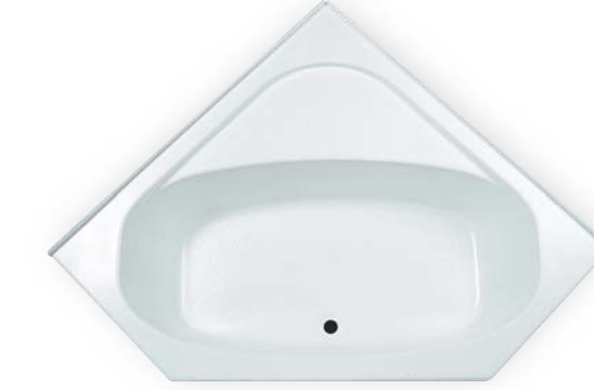
CORNER GARDEN TUB Fiberglass MODEL# RE4000 CENTER DRAIN 54" x 54" x 24" x 24" x 42" x 18"H