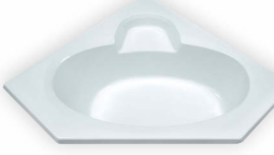
CORNER GARDEN TUB Fiberglass MODEL# RE4040 CENTER DRAIN (FRONT) 59" x 59 1/2" x 26" x 26" x 47" x 20"H